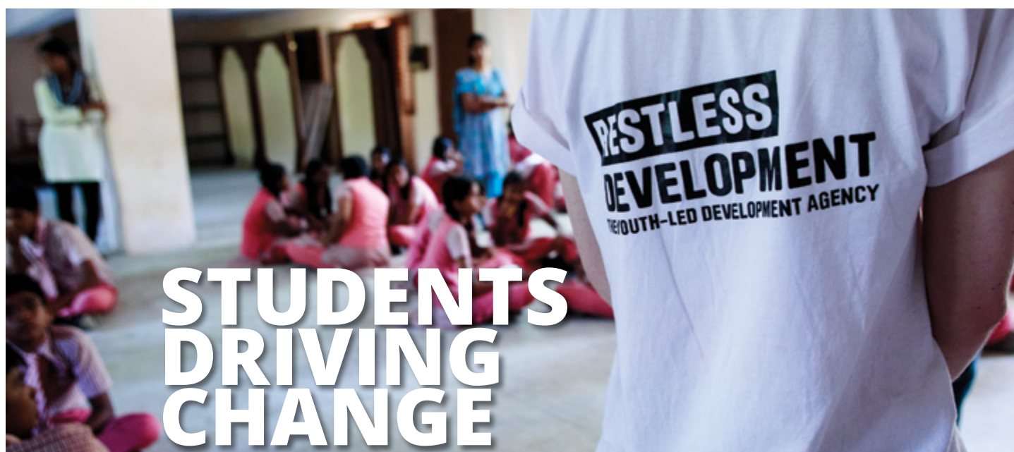
Youth Development and Leadership Program workshop run by Restless Development with support from Macquarie University students at St. Antony's Matriculation Higher Secondary School in Chennai, India, 2015. Restless Development's strength comes from being led by young people from the boardroom right through to the field.

Since 2009, we have deployed more than 1,500 Australian students to 13 developing countries.